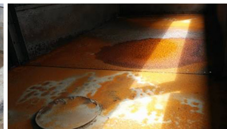
HOLDING PAN (BEFORE)