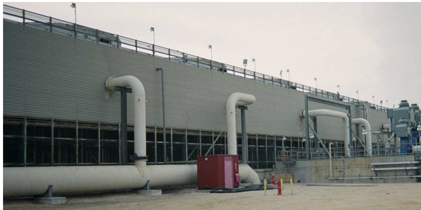
COOLING TOWER SYSTEMS