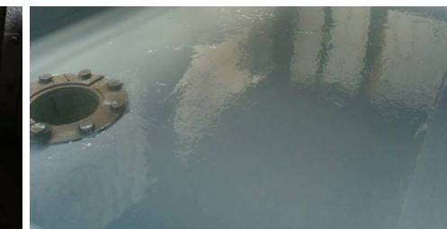
HOLDING PAN (AFTER)