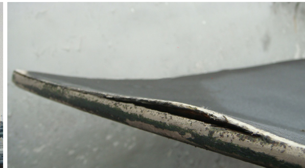
FAN BLADES (BEFORE)