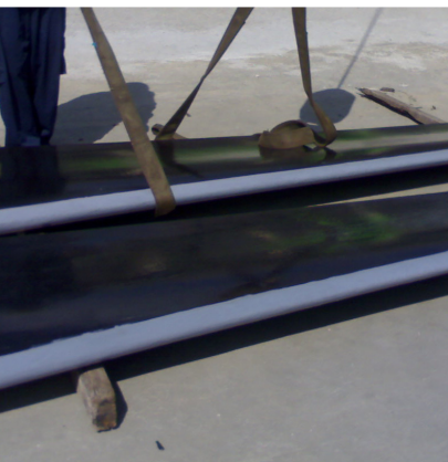
FAN BLADES (AFTER)

Since its beginning in 1952, Belzona has been committed to developing and manufacturing polymeric solutions and providing customers with 24/7 technical support.